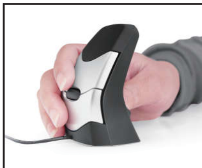
4. Right hand front view