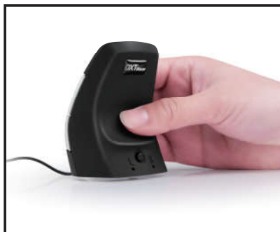
3. Mouse set for right hand use