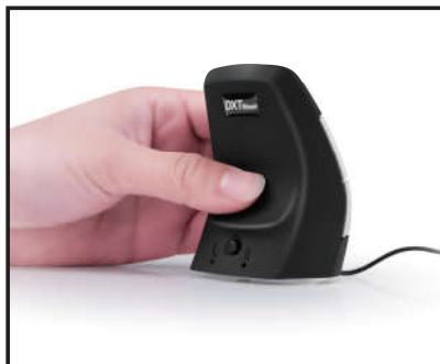
1. Mouse set for left hand use

Press the button (A) beneath the thumb surface to select either left or right hand use – a red light will illuminate under L (Figure 1) for left hand use or R for right hand use (Figure 3).