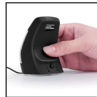
2. Mouse set for right hand use