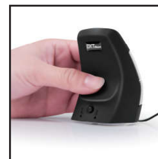
1. Mouse set for left hand use