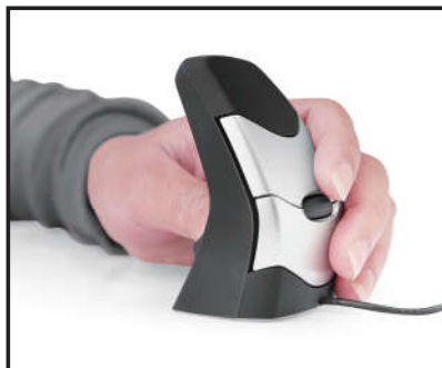
2. Left hand front view