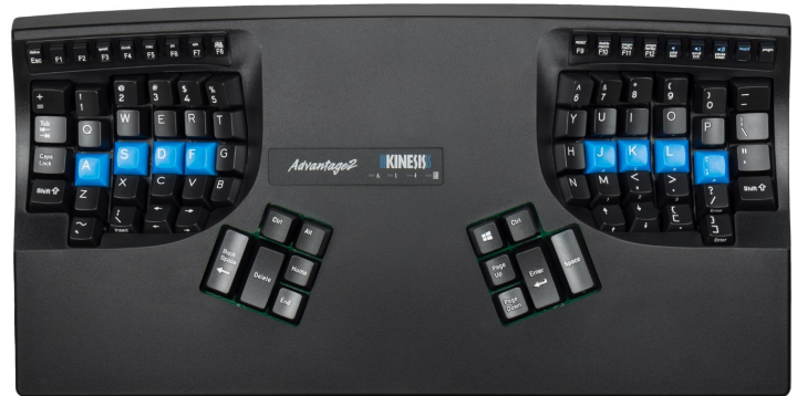
Fig 1. KB600

No special software or drivers are needed. The Advantage2 is plug-and-play with all operating systems that support full-featured USB keyboards.*