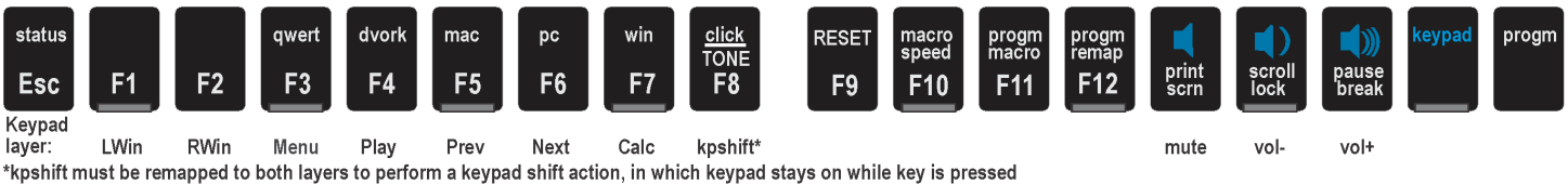
Fig 7. Function key row (Cherry low-force mechanical key switches with tactile ridges)

Note: Actions legended in lower case require only the Program Key to activate, whereas actions legended in CAPS require the Program Key plus Shift Key to activate.