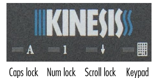
Fig 11. Keyboard LEDs

The blue LEDs located near the center of the keyboard indicate the status of the keyboard. The LEDs will illuminate when each of the four basic modes is active (see Fig 11). These LEDs also flash during SmartSet programming actions (slow or fast) to indicate the keyboard’s temporary programming status.