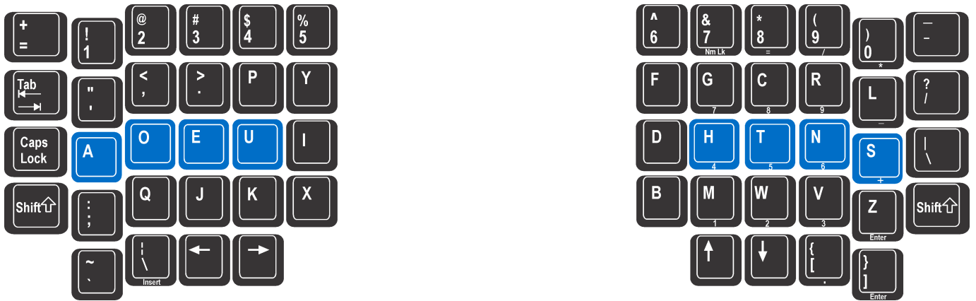
Fig 3. Dvorak Layout (prog+F4)

Every Advantage2 also comes preloaded with a customizable onboard Dvorak layout. Dvorak typists can elect to purchase the KB600QD keyboard which comes with dual-legged QWERTY-Dvorak keycaps installed, or they can upgrade any Advantage2 keyboard by purchasing a set of QWERTY-Dvorak (KC020DU-blk) or Dvorak-only keycaps (KC020DV-blk) to install themselves.